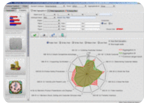
EDuQua uses the technology from the product called COASTS, developed by synthesis GmbH Germany

for each party of the VET community of vocational training and VET.