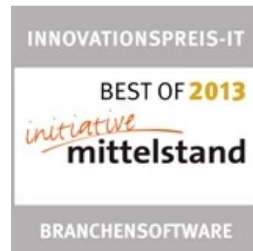
EDuQua, awarded methodology.